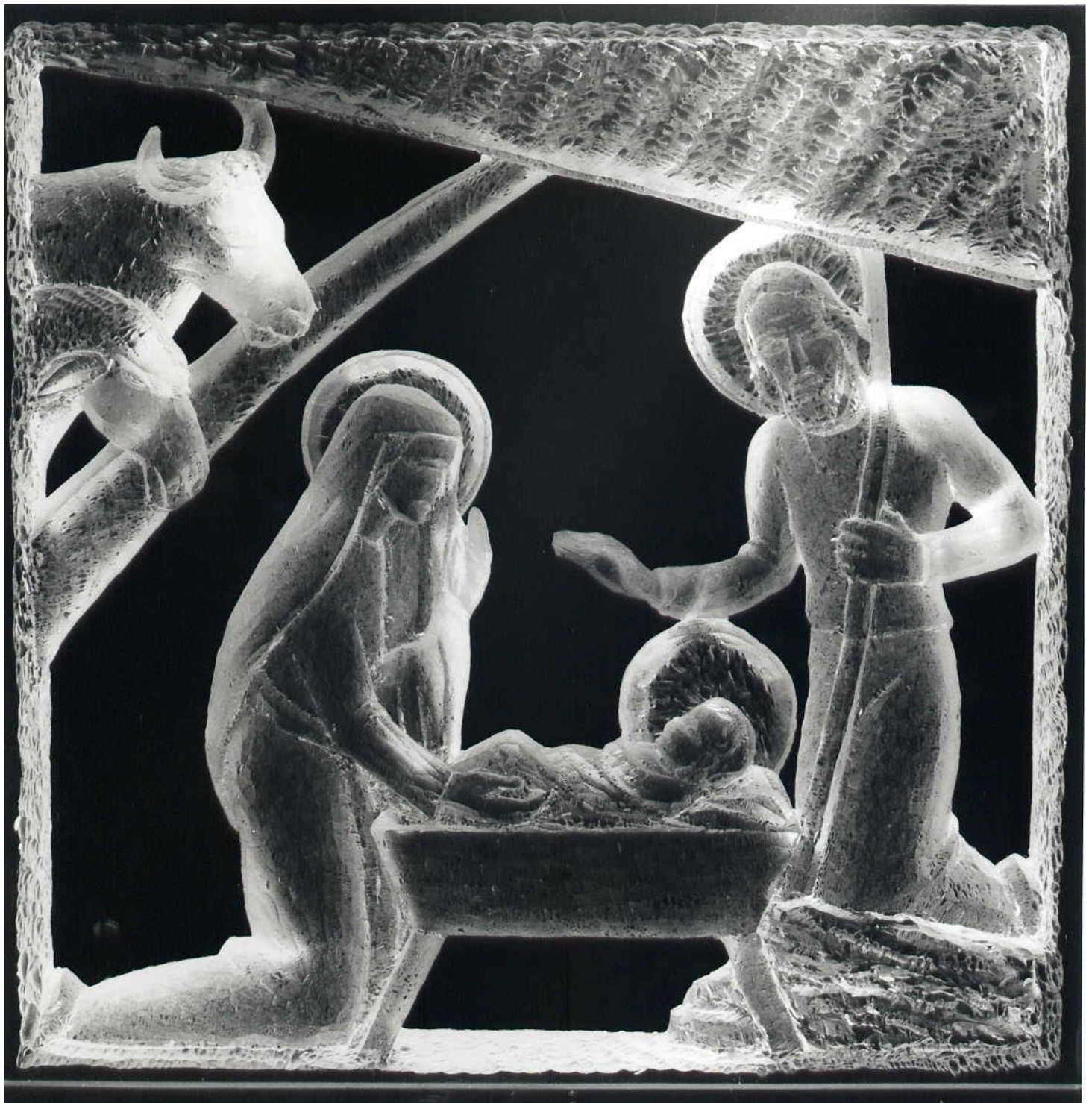
The Mystery of the Nativity