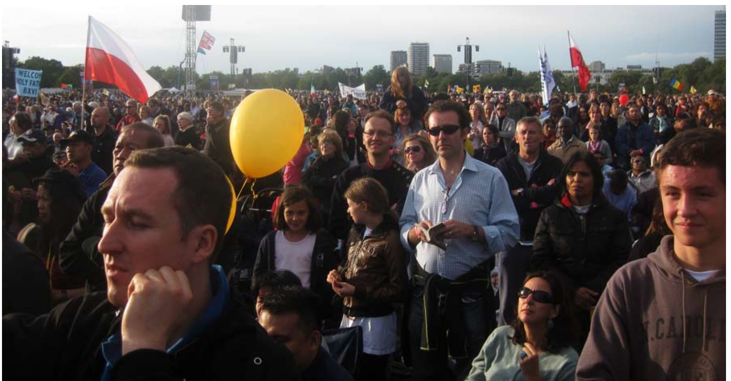
Members of the parish of St Johns Wood at the celebration with Pope Benedict in Hyde Park