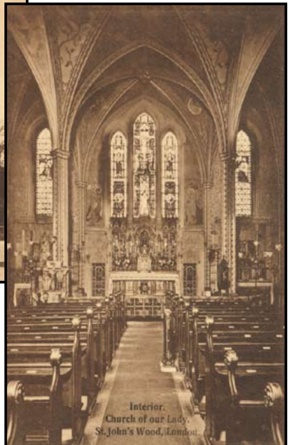
Interior. Church of our Lady. St. John's Wood, London.