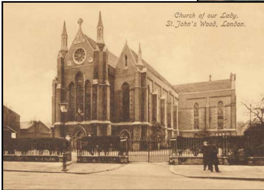
Church of our Lady. St. John's Wood, London.