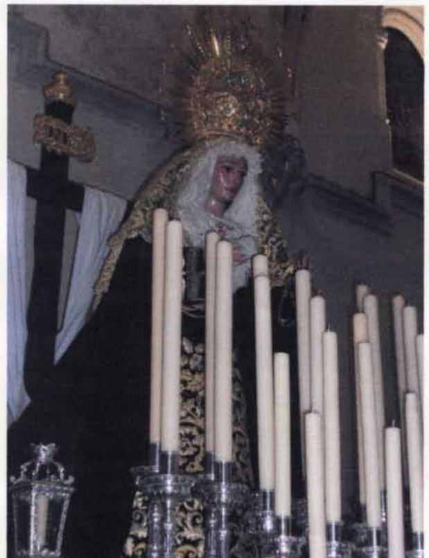
These are different images of the processions we saw.